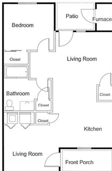
Meadows One Bedroom Flat - 720 SqFt

The Meadows apartments offers (10) one bedroom, (25) two bedroom, and (25) three bedroom units with several different floor plans including town homes, one-level flats and walk-up units. There are handicap accessible units available in all apartment sizes.