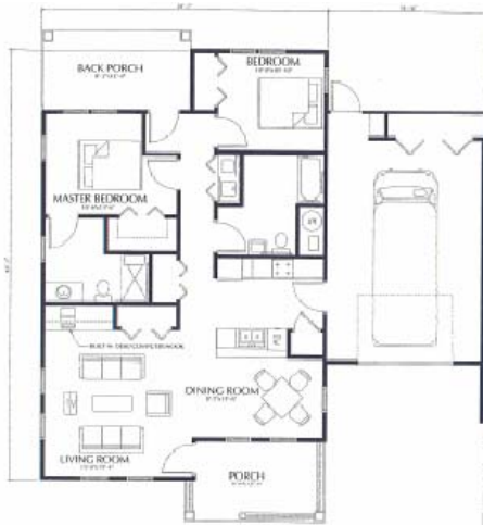
FLOOR PLAN, 2-BEDROOM UNIT