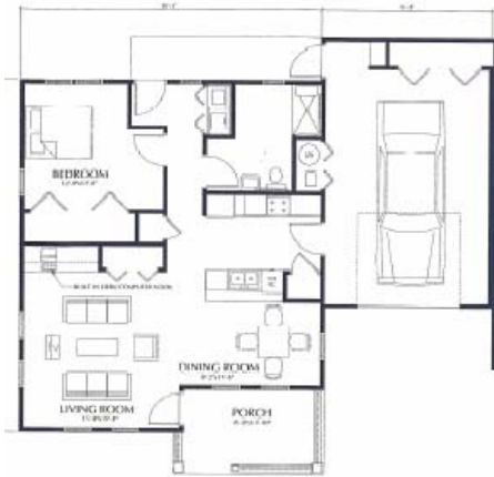
FLOOR PLAN, 1-BEDROOM UNIT